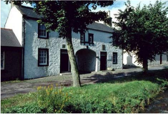
The Birthplace of Thomas Carlyle