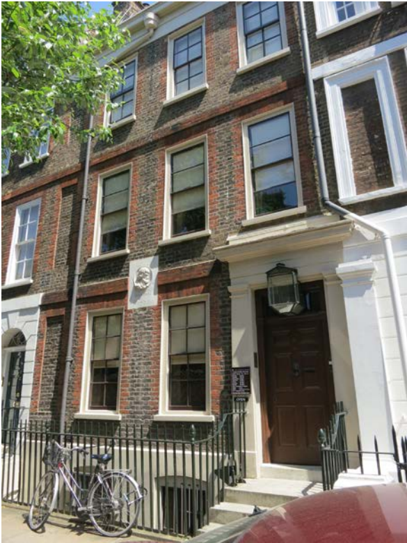
24 Cheyne Row, Chelsea