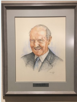
Grant MacEwan portrait